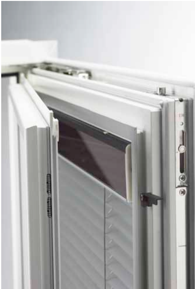
Solar operating blinds